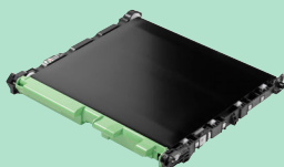
Belt unit BU635CL