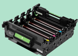
Drum unit DR625CL